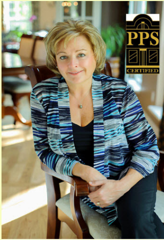
Facilitator - Learn more..